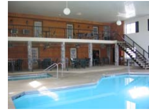
Come and enjoy our pool, hot tub and game room.

For those interested in winter sports, we are located on the Portage County snowmobile trail and within minutes of the cross country ski trails.